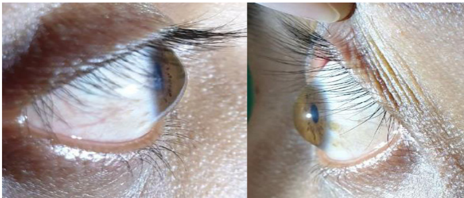
Figure 1. Preoperative lateral eye view.

The first day after the procedure (RLE + IOL + CTR), VA of the right eye was 6/9 and VA of left eye 6/45 PH 6/18. The conjunctiva both eyes showed subconjunctival bleeding, cornea showed corneal edema and Descemet fold, and IOL in place. A week and a month after surgery, the visual acuity in the right eye was 6/6. The visual acuity left eye was 6/45 PH 6/18, anterior segment of both eyes within normal limits, IOL (+).